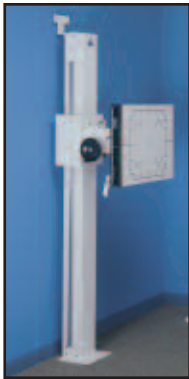
Tilting Bucky Structure with gear-driven adjustment, ideal for upper cervical images.

Over 1,200 DC-1 systems currently satisfy the radiographic needs of the chiropractic profession. Leading the industry, the DC-1 system includes a 0.6/1.5 mm fractional focal spot x-ray tube as standard to provide finer image detail and meet the unique application requirements of rare earth film and screens. In addition, the hospital grade 200,000 heat unit capacity of the tube compliments the increased power output of HCMI high-frequency generators. Also standard on the DC-1 is a full-length, Vertical Frame designed exclusively for chiropractic imaging to allow the heavy-duty 17" film cabinet to travel without contacting the patient. Complete spinal imaging is easily performed without re-positioning the patient. A 10:1 ratio, fine line grid and heavy-duty cassette tray are included as standard for the optimal in image quality. Examples of popular options to the DC-1 include: