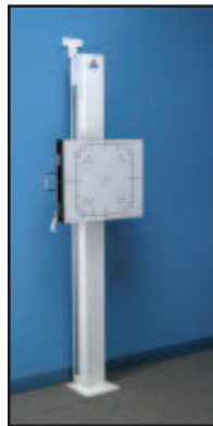
Conventional Vertical Structures for 17" x 17" or 14" x 36" film cabinets.