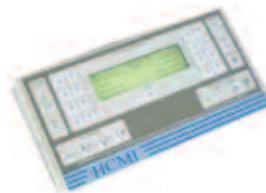
HF-30 Console with optional AP

Ideal for the budget minded practice, the HF-30 uses 20 kHz high frequency technology and provides full 30 kW power for general radiographic needs. The operator friendly console provides fast 2-point technique selection. An optional anatomical programming mode offers consistent, effortless images by fast, automatic technique selection.