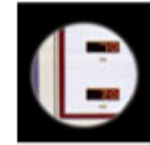
Digital kVp readout